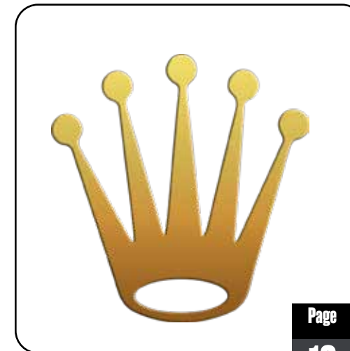
PlanNet Rolex Club